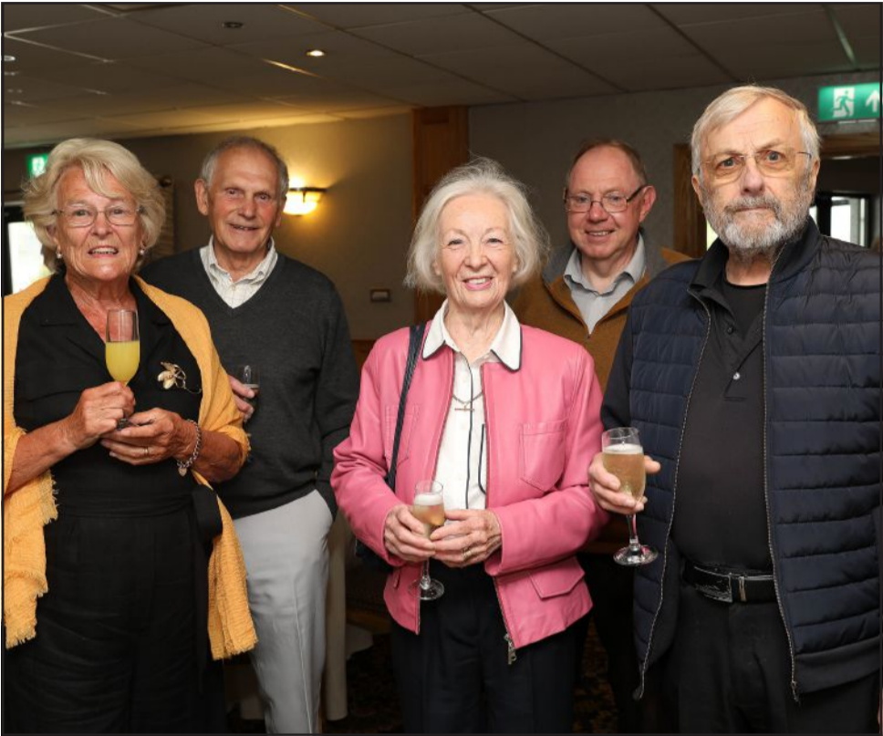
Helpers and guests enjoying the launch of the third Anthology ‘Sea Spray and Woodland Glades’ by writers from the North Coast of Ireland held at the Royal Court Hotel, Portrush. WK22-12TM

“To rework the old adage: if it takes a village to raise a child it takes a community to foster a writer.”