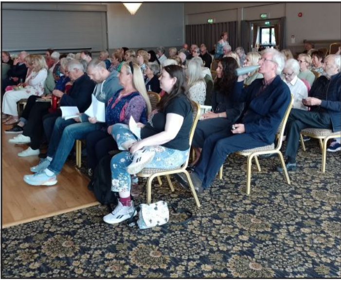
A section of the audience at the launch of the third Anthology ‘Sea Spray and Woodland Glades’ by writers from the North Coast of Ireland held at the Royal Court Hotel, Portrush. WK22-13TM